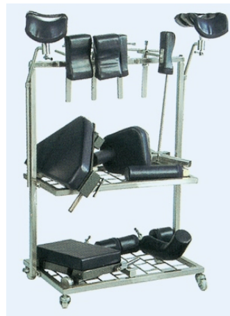
Stand for Table Accessories