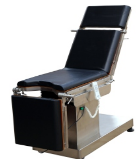
BACK SECTION +90°/ -45°