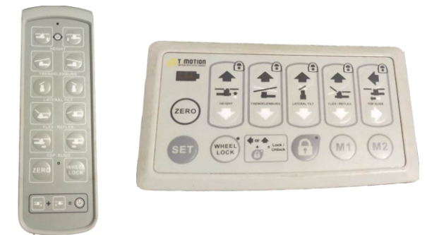
HAND HELD REMOTE AND OVERRIDE CONTROL PANEL FOR ALL FUNCTIONS