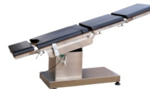
TRENDELENBURG & REVERSE TRENDELENBURG 25°