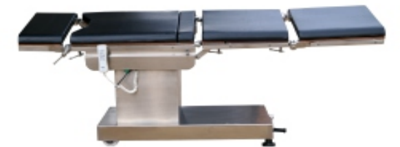
LATERAL TILT BOTH SIDES 20°