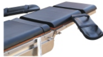
Intravenous Arm board with wrist straps