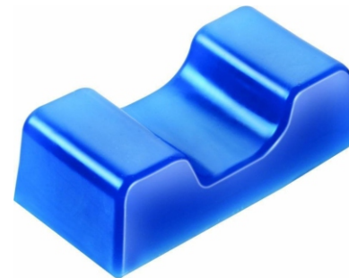
Gel/ Pu Foam Calf Support