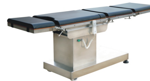
HEIGHT ADJUSTMENT 66 TO 100cm