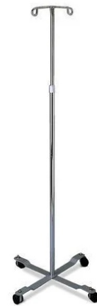
Swivable Mobile IV Stand