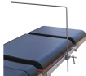
Anaesthetic Screen with clamps