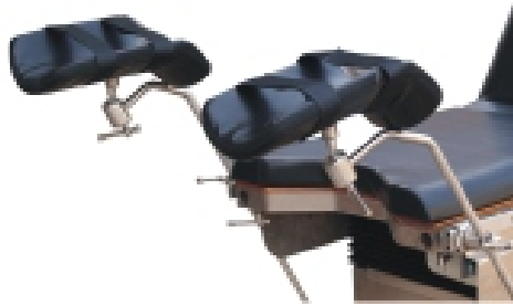
Padded Lithotomy Crutches with radial clamps