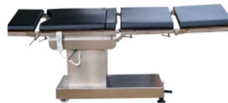
LATERAL TILT BOTH SIDES 20°