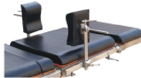
Padded Lateral Support with clamps