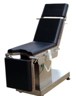
BACK SECTION UP/ DOWN +70°/ -45°