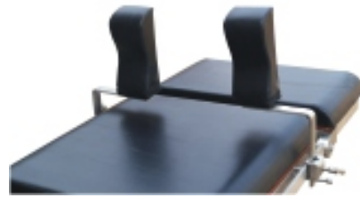
Padded Shoulder Support pair with clamps