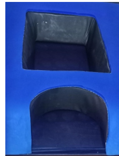
Gel Pad for Prone Position