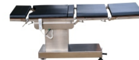
LONGITUDINAL SLIDE 250 MM