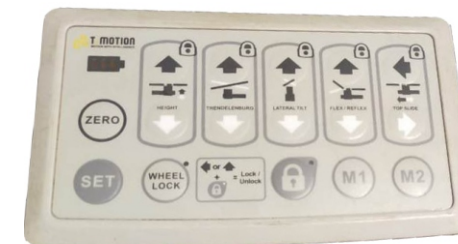
HAND HELD REMOTE AND ELECTRIC OVERRIDE CONTROL PANEL FOR ELECTRIC FUNCTIONS